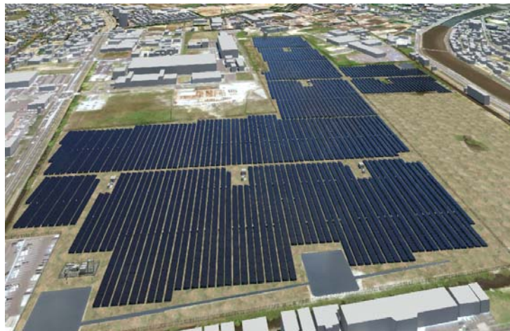
MITSUI & CO., LTD. : 19.6MW Under Construction (Aichi)