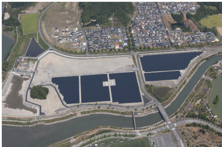
Sanko Real Estate : 5.2MW Under Operation (Mie)