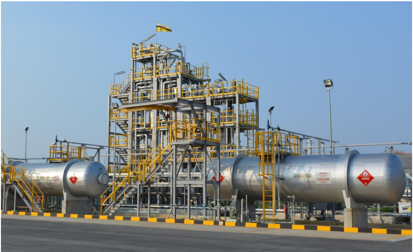
Hydrogenation plant in Brunei

1. Japan's New Energy and Industrial Technology Development Organization. From 2015 until 2020, NEDO conducted a global-supply-chain pilot project that used Chiyoda Corporation's liquid organic hydrogen carrier (LOHC) technology to transport hydrogen from Brunei to Kawasaki City in Japan's Kanagawa Prefecture. The technology uses MCH as a hydrogen carrier.