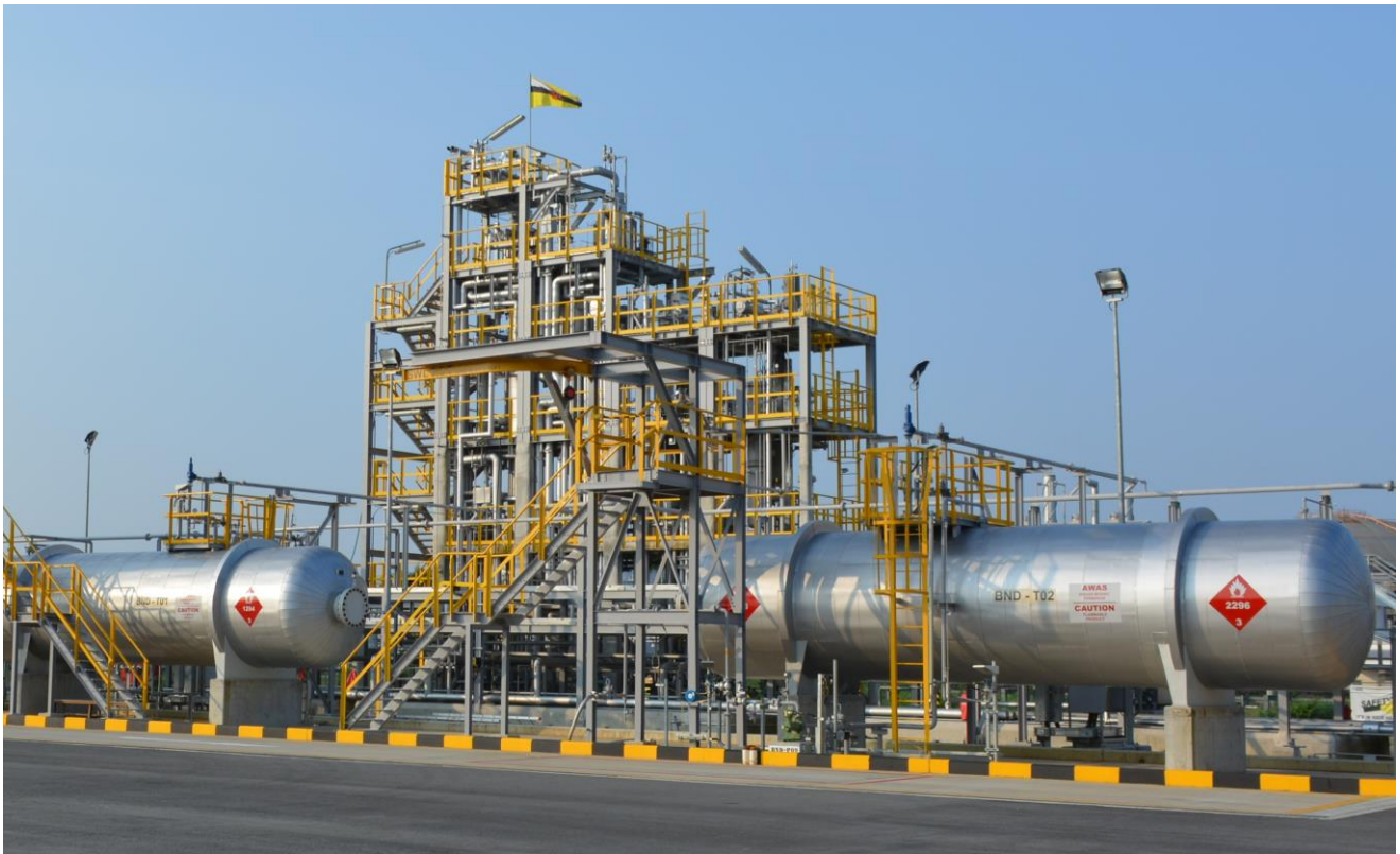
Hydrogenation plant in Brunei

1. Japan's New Energy and Industrial Technology Development Organization. From 2015 until 2020, NEDO conducted a global-supply-chain pilot project that used Chiyoda Corporation's liquid organic hydrogen carrier (LOHC) technology to transport hydrogen from Brunei to Kawasaki City in Japan's Kanagawa Prefecture. The technology uses MCH as a hydrogen carrier.