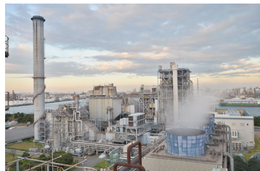
Hydrogen is supplied to Gas Turbines