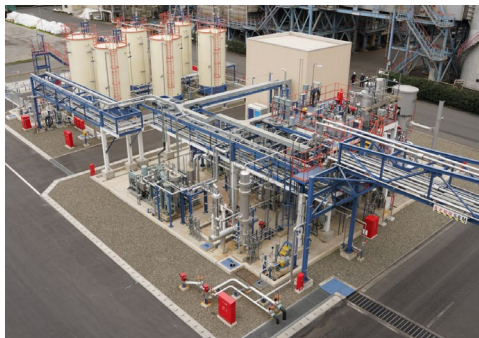
Dehydrogenation Plant Kawasaki, Japan

Chiyoda will work in close cooperation with Mitsubishi Corporation, Mitsui & Co., and Nippon Yusen Kabushiki Kaisha, the other association members of AHEAD, to confirm the effectiveness of global hydrogen transportation through this project.